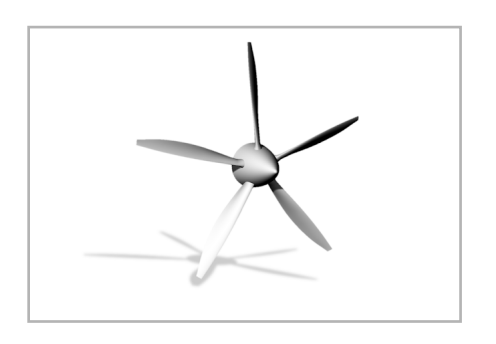
Optimization results: the final propeller design.

Before using modeFRONTIER, Pipistrel went through a manual process to simulate multiple designs and choose the preferred one. With the introduction of ESTECO Technology, Pipistrel engineers not only were able to automate this process, but could evaluate options not considered otherwise. "modeFRONTIER optimization technology gave me the opportunity to think outside of the box - said Rok Lapuh, Aerodynamics Engineer at Pipistrel - We could find a design that is completely different from what we're used to, but that may work even better".